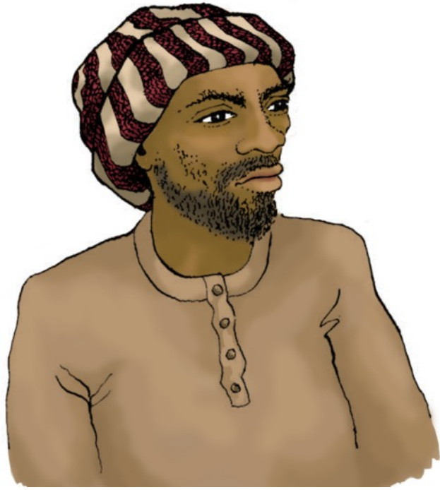
Baba ana ndevu.