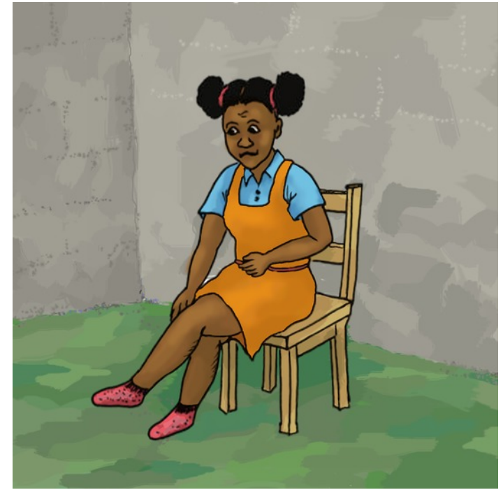
Soksi hizi ni fupi.