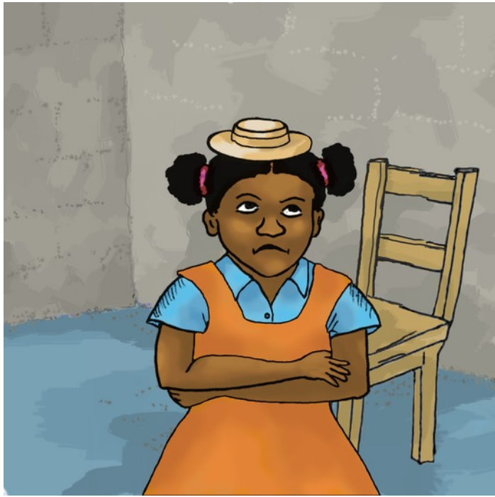
Kofia hii ni ndogo.