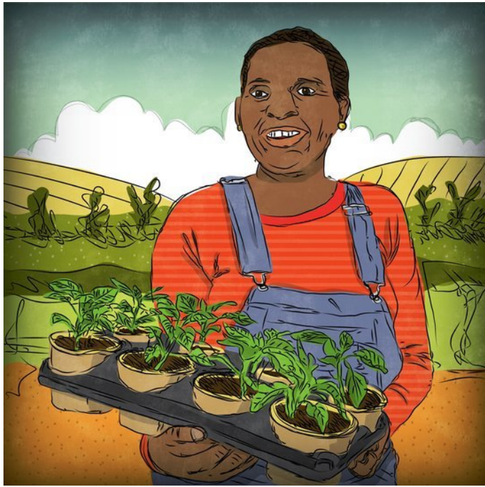
Lo ngu-Ayanda, ummelwane wam.