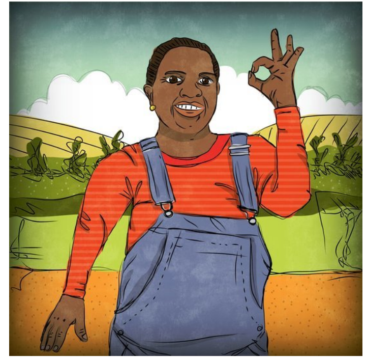
U-Ayanda sisithulu. Uthetha ngezandla.