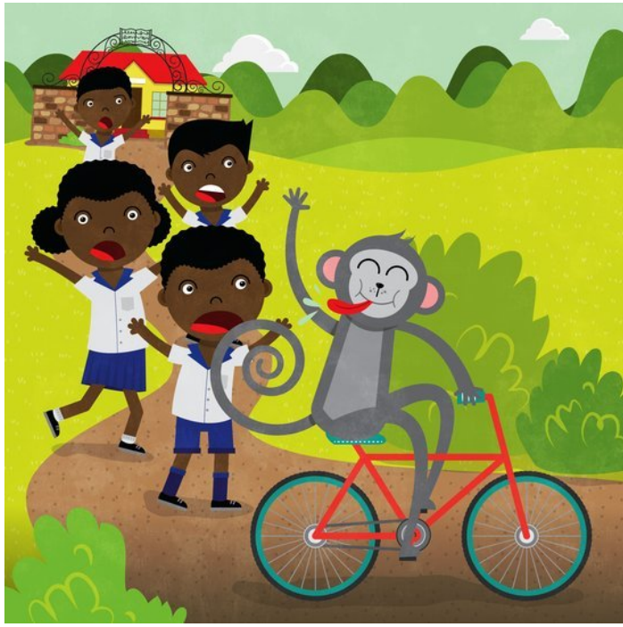
Abantwana baleqa inkawu.