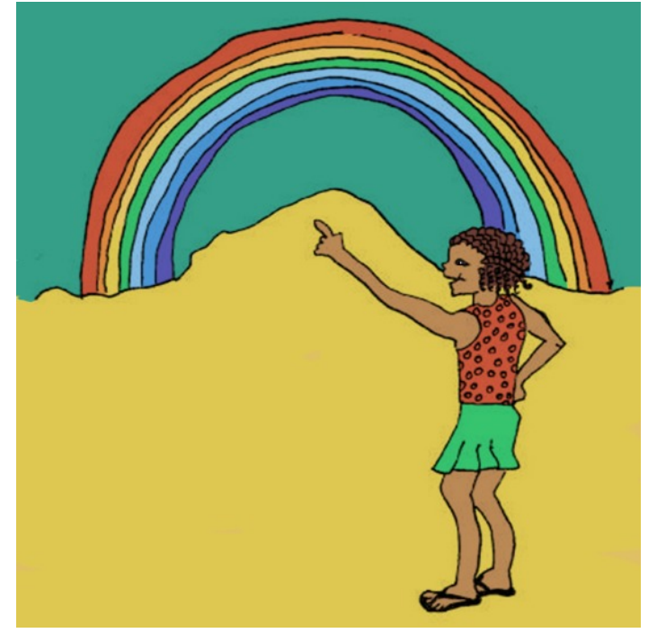
Bir gökkuşuğu gördüm.