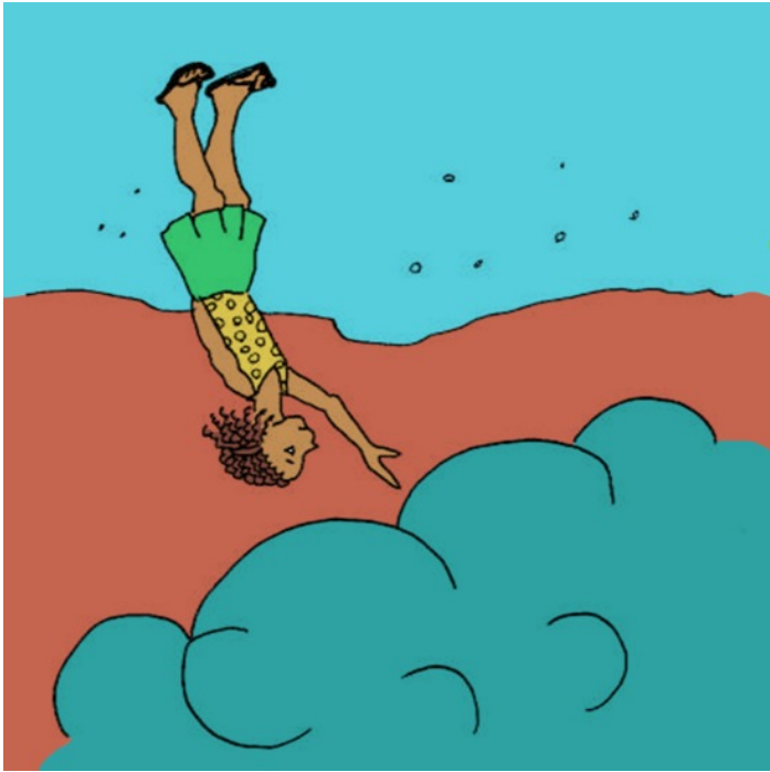
। ୧ । ଡି.ଏ.ଏ.ଏ.