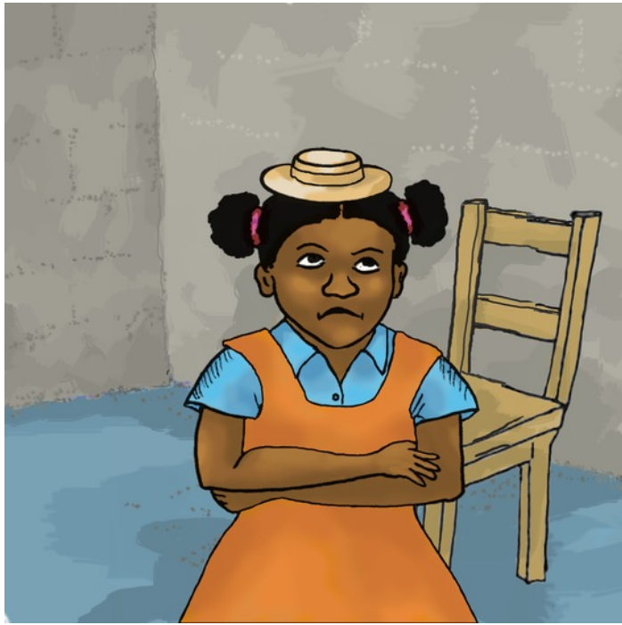
This hat is small.