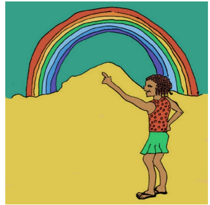
Tôi thấy một cầu vồng.