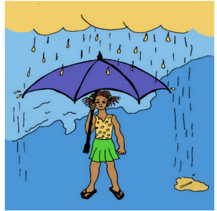
Trời đang mưa.