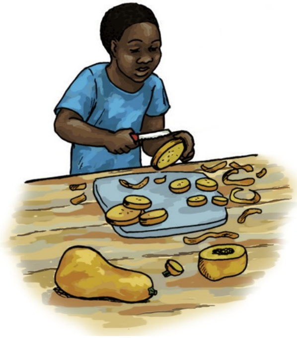
난 버터넛을 잘라.