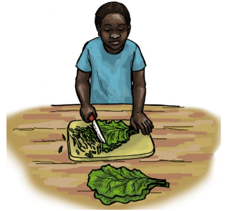
난 시금치를 썰어.