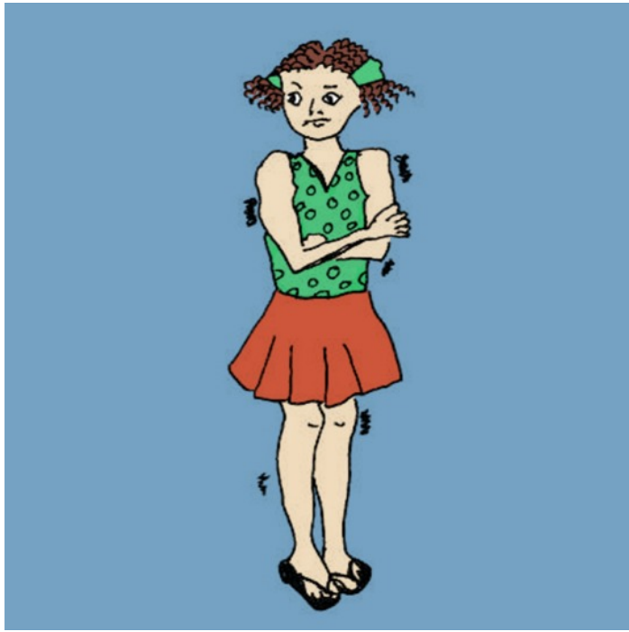
Il fait froid.