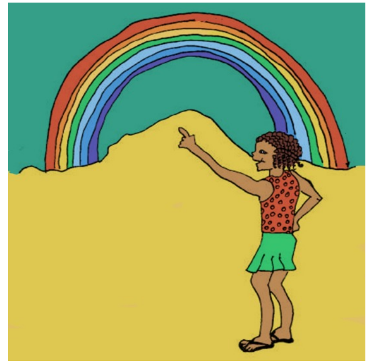
Je vois un arc-en-ciel.