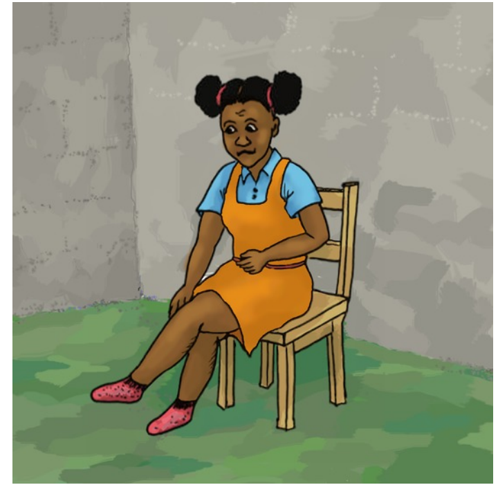
Les chaussettes sont courtes.