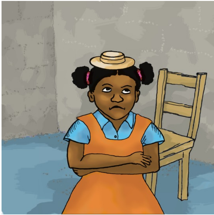
Ce chapeau est petit.