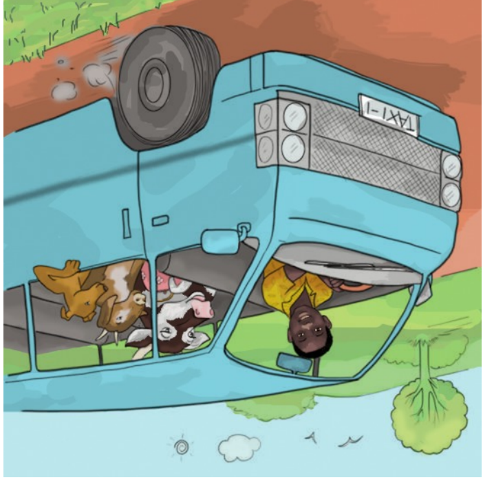
Goat, Dog, and Cow